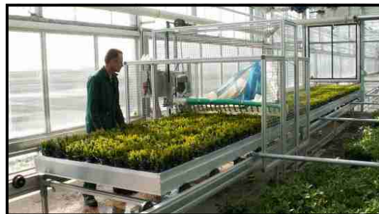
* ELECTRIC EASY CUT FOR ROLLING BENCHES