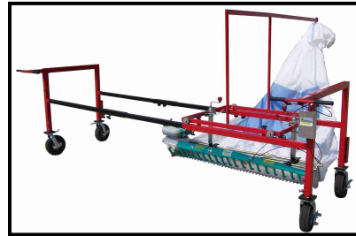
* TELESCOPING FRAME